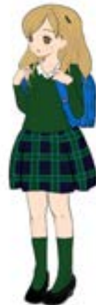
Alejandra Gallardo 1º Bach A

It is common to feel like you are not fitting in when you are 'new' but give it time, try to open yourself up to others and do not stress too much. Will it be easy? No. Will it be worth it? Absolutely. Don't be afraid to start over: it's a new chance to rebuild what you want.